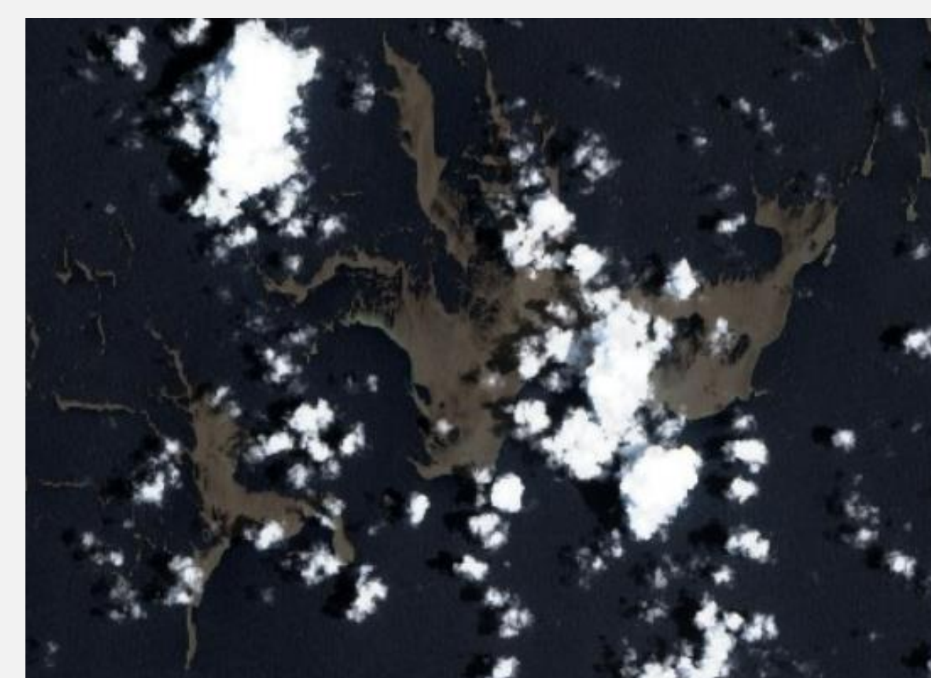
Fig. 3 Pumice raft near Hunga Tonga-Hunga Ha'apai on 28 December 2021.