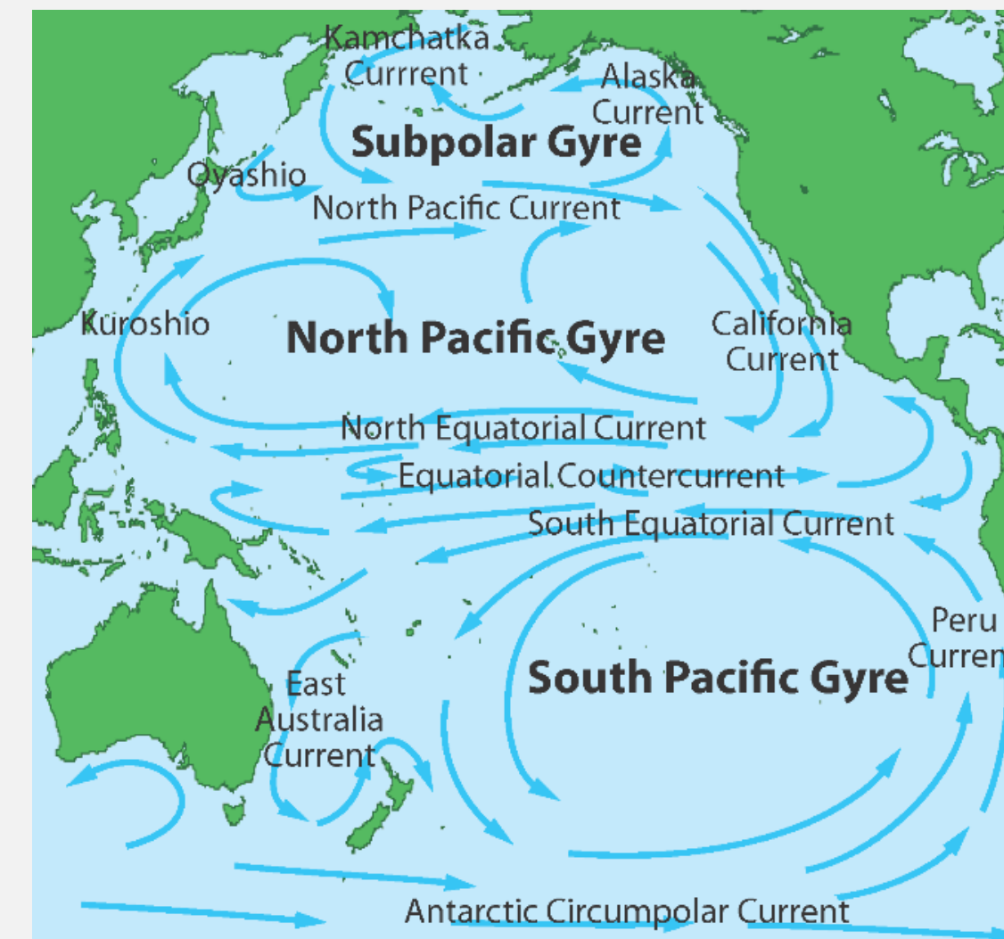
Fig. 1 Major currents in the Pacific Ocean (Education Development Center, 2017).